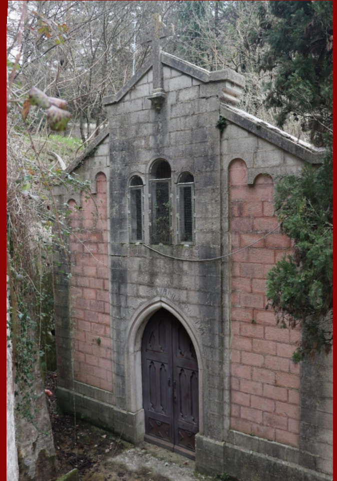
The Hermitage of Capodacqua where he retired