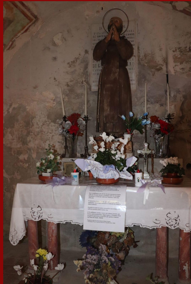
Inside the Hermitage