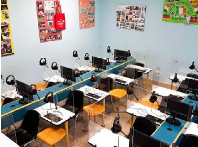
Language Lab. (REVOX)

Another option is the Language course where, apart from English, French and German are studied; this course focuses on the languages experienced abroad through projects (Erasmus), Cambridge course and cultural exchanges.