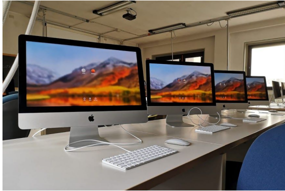
Mac computer Lab.

The technical institute for graphic design and communication that specializes in graphics and up to date advertising products.