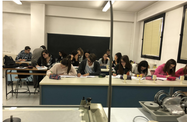
Physics and chemistry Lab.