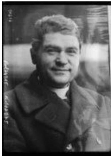
Raffaele Casimiri (Gualdo Tadino, 3 november 1880 - Rome, 15 april 1943)