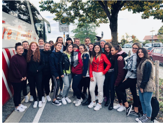
Foreign trips and cultural exchanges